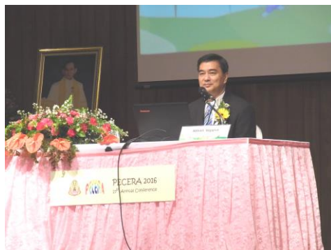
Mr. Abhisit Vejjajiva Leader of the Democrat Party, Thailand

Worth Investment for Developing Human Capital in Thailand (birth-8)