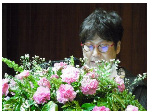
Message from President of PECERA International.