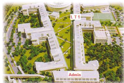
National Institute of Education

Buses: 199, 179 and 179A from Boon Lay MRT/Interchange (Jurong Point Mall)