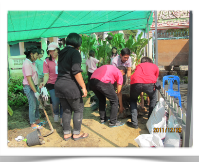
Collaborative work with the community people