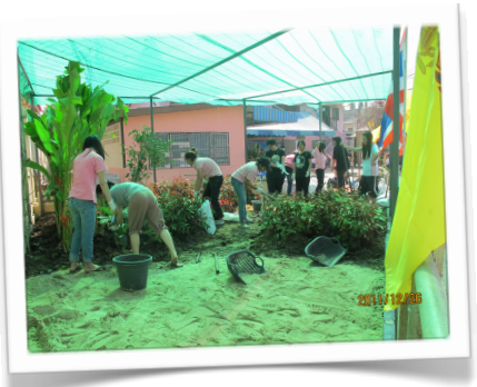
Making sand area for children to play