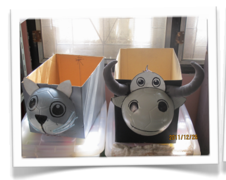
Creative box made from recycle ball