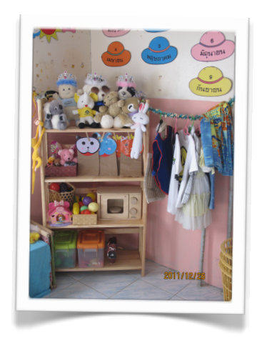
Dramatic Play Area